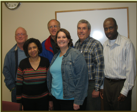
The HOPE Advisory Board

HOPE Mission International believes that God loves all people and desires a relationship with them. Often physical, emotional, social and spiritual needs prevent people from responding to the gospel. HOPE Mission International exists to create the bridge between people and resources in order to eliminate the barriers that may prohibit them from having a relationship with Christ. In cooperation with national believers, this is achieved through community services, youth outreach, job creation, relief efforts and educational endeavors.