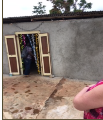
Rebuilt and stronger to face the next storm