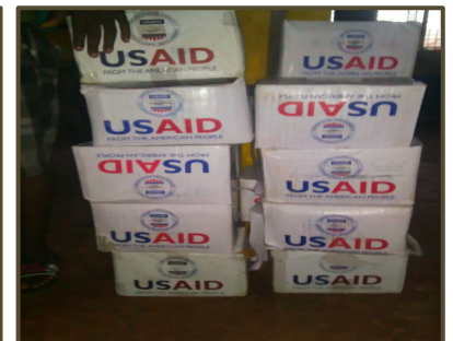
Relief Supplies provided by US Aid- tarps, blankets and hygiene kits