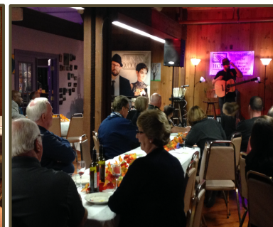
A great evening of connecting, fellowship and worship