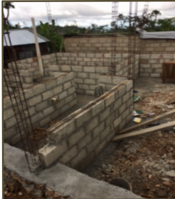
Lots of progress for this family