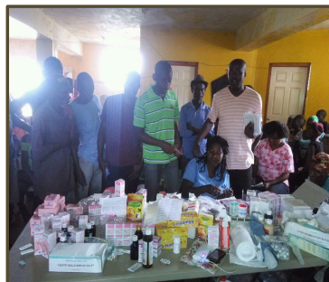
Mobile Medical Clinic held at the HOPE Library