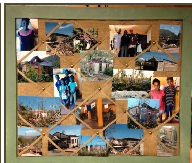
Photographs of Hurricane Matthew damage and relief efforts