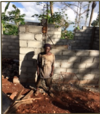
Rebuilding one staff member's home

We have also evaluated the needs among the families of our Sponsored Children. Currently, we have undertaken $7500 in repairs to help 8 families and 1 school. We look forward to sharing updates on progress!