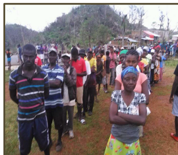
Community members lined up to receive relief