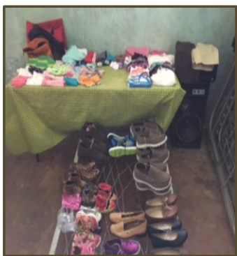
Donations delivered to the Duchity Community

A small team traveled to Duchity in December and held 3 nights of spiritual revival meetings aiming at encouraging the believers in their faith in Christ. On the 2nd night, 14 people came forward. Three of them asked for healing prayers (all 3 have some issues with blood flow). The other 11 understood that if they were to die at the time of the hurricane, they would not be in heaven. Therefore, they came and received Jesus Christ as Lord and Savior. We also invited all leaders (Pastors, Lay Leaders, Deacons, and the worship team) to come forward for a prayer of God's protection upon them and unity among themselves