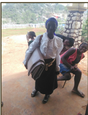
Receiving a tarp to cover the roof of her damaged home