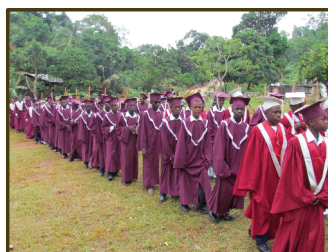
60 Graduated from the Computer Skills Training Course