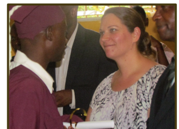
Graduates receiving their certificates