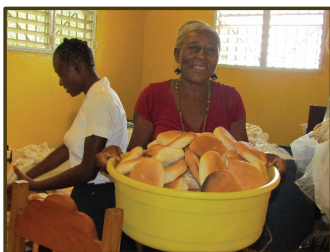
Sandwiches made by ladies to feed ceremony guests

It was a long ceremony and being a non-French speaker, I was able to focus on the expressions and reactions of all the participants. I saw pride on each of the graduates faces. They had attended weekly classes for a total of 50 hours. This required dedication and commitment on their part. The classes covered the basic skills involved with Word, Excel and Power point. Albeit an introduction, they had achieved skills that will aid them in the future. There is now a foundation present that they can build upon for future training, educational opportunities and employment. I also noticed the great pride on the faces of their family members and friends. They too recognized the hard work and commitment of their loved one. I also saw HOPE on their faces. They know that now their loved one has a little more skill to make them a viable, employable individual. Above all this, each week during the class, time was set aside for evangelism and Bible study. This has always been our goal- to provide the HOPE of Christ to this community and demonstrate that there is HOPE in this world. Thank you for contributing to help us provide this training program in Duchity. Two more classes will begin this fall!