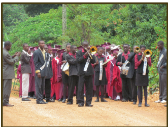
Brass Band leading the graduation processional